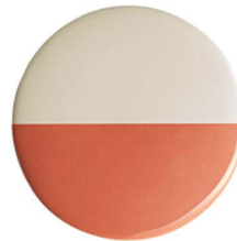
APC ARANCIO POKE' + CREMA