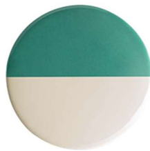
CRT CREMA + TURCHESE