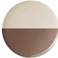
MOC CREMA + MOKA