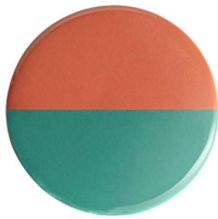
TUP TURCHESE + ARANCIO POKE'