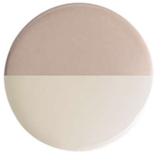
CRG CREMA + GRIGIO SABBIA